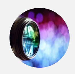
Creative Economy & Film Industry